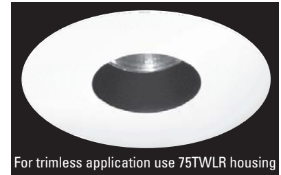
For trimless application use 75TWLR housing